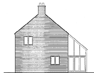
Plot 11 Side Elevation