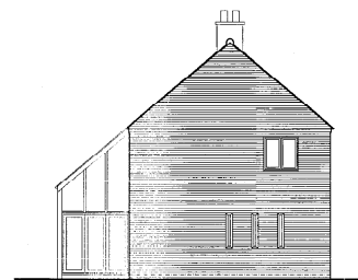
Plot 13 Side Elevation