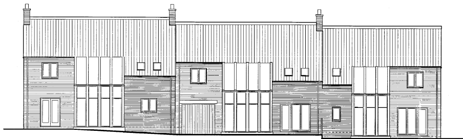
Plot 11 Rear Elevation